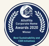
BEST SUSTAINABILITY AND CSR INITIATIVES 2020 Winner