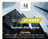
BEST PROPERTY MANAGEMENT 2022 Winner