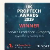
SERVICE EXCELLENCE - PROPERTY 2019 Winner